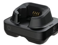
IMPRES 2 Single-Unit Charger NNTN9199