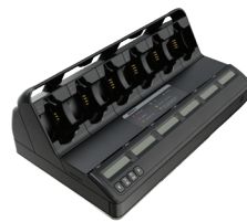
IMPRES 2 Multi-Unit Charger NNTN9115